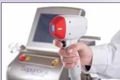
Alex 755 nm handpiece